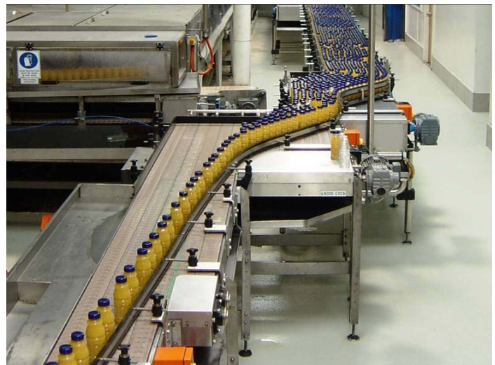
*Delivered In Full On Time Accurately Invoiced