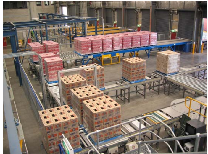
*Delivered In Full On Time Accurately Invoiced