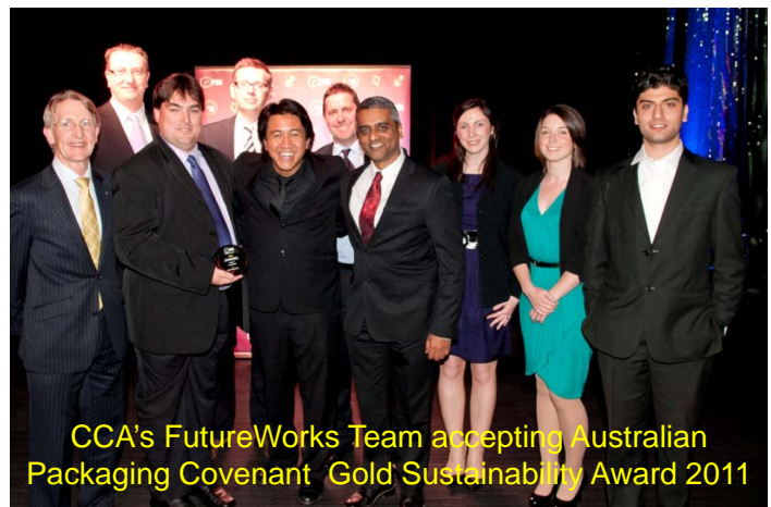
CCA's FutureWorks Team accepting Australian Packaging Covenant Gold Sustainability Award 2011